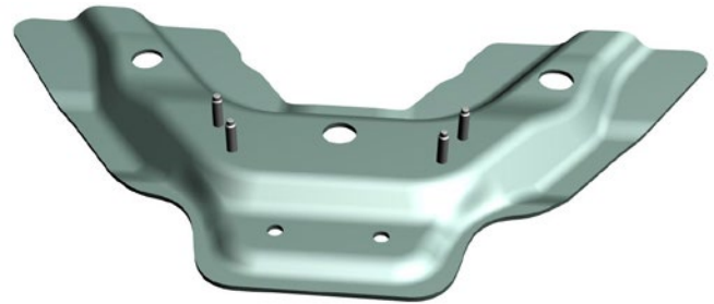
Rear view of a wood-based CFC moulded part