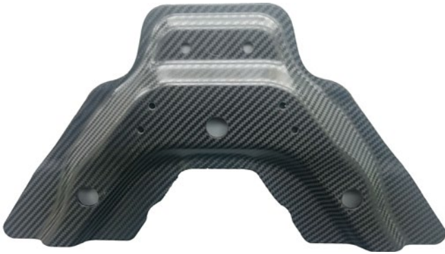
Another example of a wood-based CFC moulded part